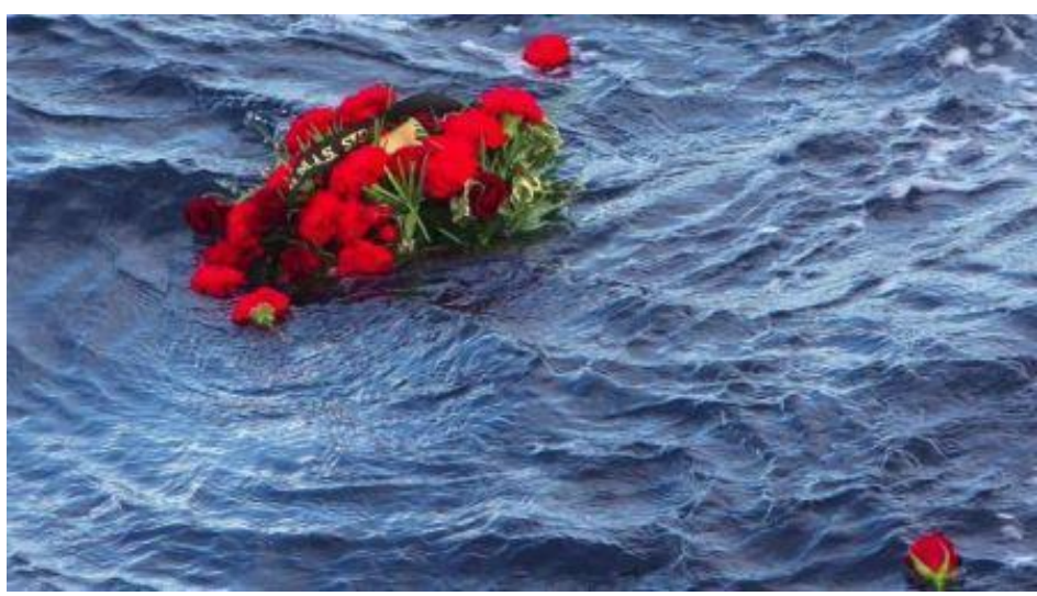
26° 14′ 45″S 111° 12′ 55″E

A tribute to HMAS Sydney II will be held along with an official observance ceremony prior to the commencement of the match. To help in this commemoration, all family and friends of those touched by HMAS Sydney II are invited to attend. Tickets can be purchased through Ticketek; <a href="https://www.ticketek.com.au">www.ticketek.com.au</a> or 132 849.